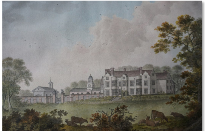
Glynde Place by J. Lambert of Lewes in the later 1700s

From the 1840s the role of the landowner changed significantly, their political influence began to decline