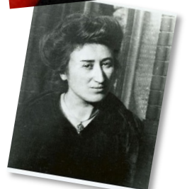
Pictured from top: Lenin, Martov, Trotsky- and Luxemburg